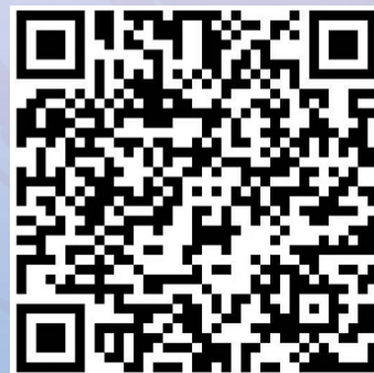
Valid until 9/9 and will update upon joining group

You may also scan the below group chat code to become one of our awesome dancing members! Look forward to having a great fun time with you! 🎉